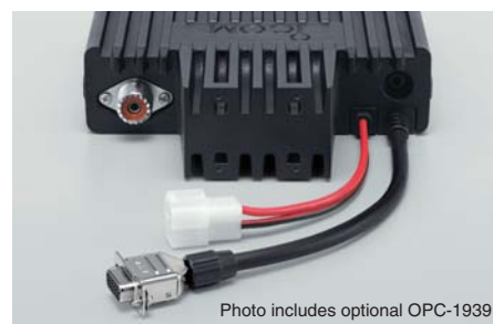
Photo includes optional OPC-1939

With the optional OPC-1939 D-SUB 15-pin ACC cable, the IC-F5023/H series can be programmed to control an operating channel from an external device (up to 16 preprogrammed channels). The ACC connector also provides an ignition sensing function, external PTT, PC command, horn honk, audio output and modulated signal input depending on programming.